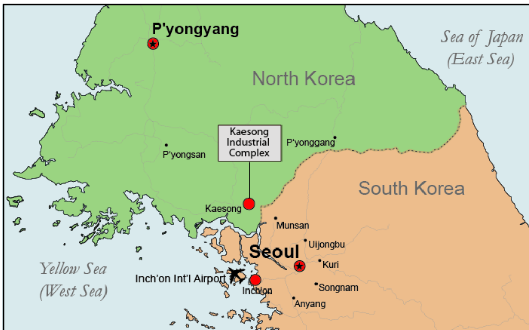
Figure 1. Location of the Kaesong Industrial Complex

Source: Map Resources. Adapted by CRS. 06/07