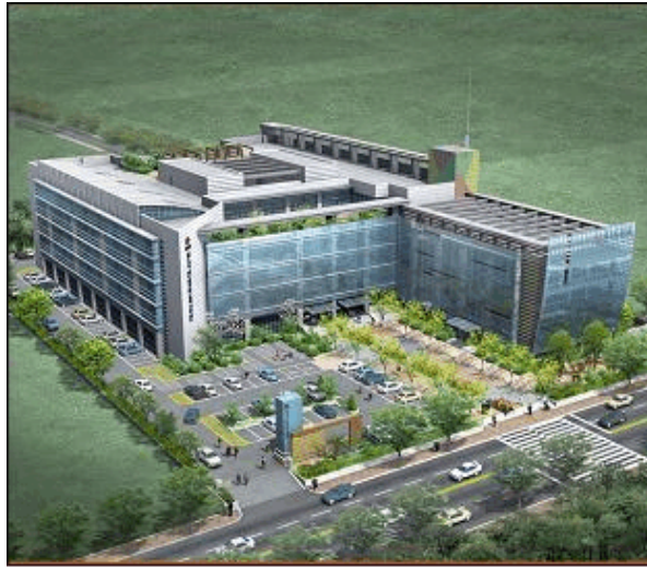
Figure 2. Leased Space Factory Building to be Constructed in the Kaesong Industrial Complex