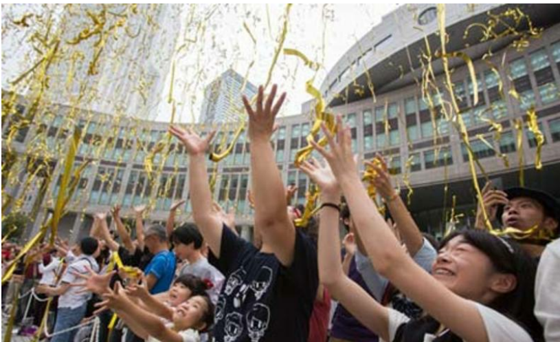
Celebrating the IOC decision in Tokyo

The September 7 decision by the International Olympic Committee (IOC) to award the 2020 games to Tokyo is potentially of monumental importance. That significance is not merely due to the fraught geopolitics of the so-called pivot to the Asia-Pacific or the collective angst of all those analysts waiting for Abenomics arrows. [1]