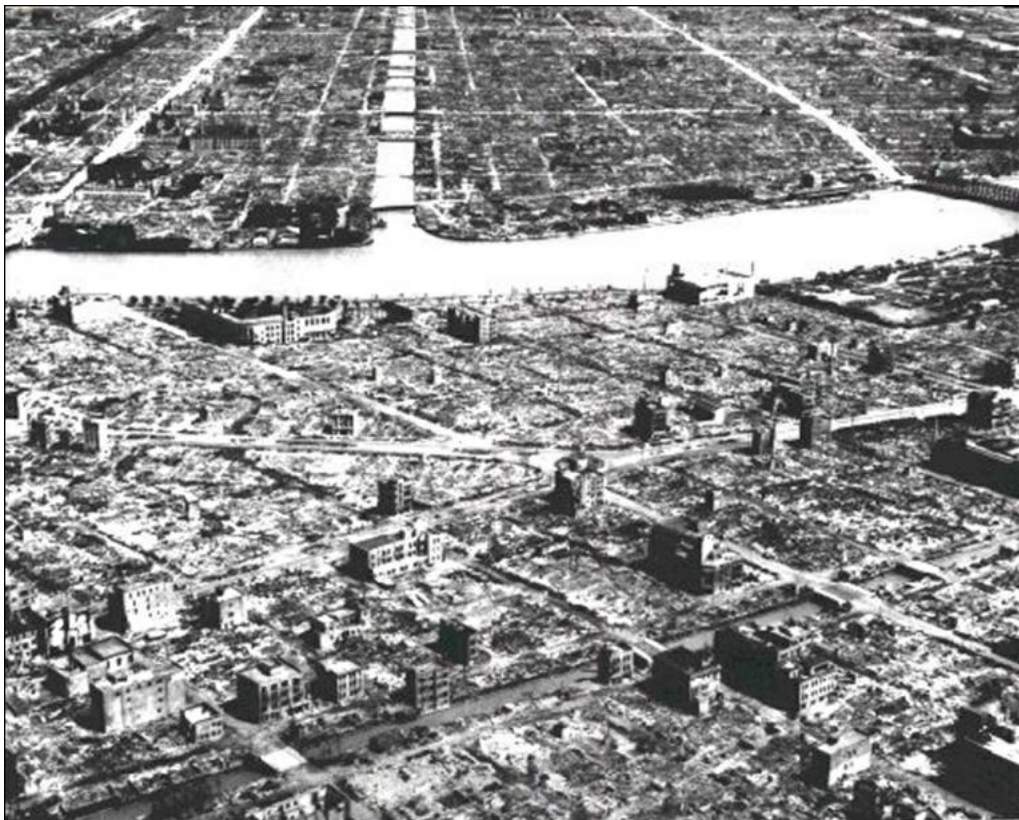
Photograph of Tokyo in the wake of firebombing of March 10, 1945

Author Saotome Katsumoto wrote in 2002 of the "war on terror": "Terrorism is, of course, a form of violence difficult to forgive, but the war being waged in retaliation is also violence ... where and in what way can we put on the brakes?" [3] For Saotome, war is wrong, and the "war on terror" an unjustifiable threat to world peace. Saotome, a survivor of the 10 March 1945 American air raid on Tokyo that killed over 100,000 civilians and left five million homeless, became a popular anti-war author. He is also a veteran grass-roots socialist activist and a lifelong supporter of progressive politics. After writing for Akahata (Red Flag), the Japan Communist Party paper in the 1960s and the 1970s, Saotome moved into a career as a writer of non-fiction. [4] He is one of Japan's most prolific authors on subjects of war and peace having written volumes for some of the most significant non-fiction series in the Japanese language – the Shinsho series from Iwanami Shoten aimed at adults and the Iwanami Junior Shinsho and Kusa no ne haha to ko de miru (Grassroots mother and child see) series for children. These works are a staple at public and school libraries across Japan and at major booksellers.