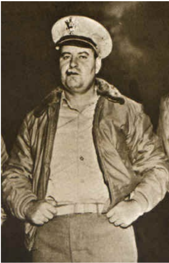
General Curtis LeMay