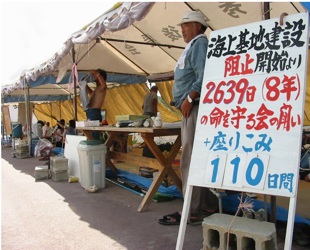
Day 110 of the Henoko anti-base struggle

I had intended to end this essay by writing "Unless the farce is quickly ended, the spectators will become angry," but it seems to me that the spectators are not angry. As one of the cast who happens to live in Okinawa (though ignored by the Japanese and American governments), I am angry, but the majority of the spectators either watch with half-dead eyes or laugh or yawn. Now that the political theatre (of the national elections of September 11, 2005) with its much ado about "assassins" and "winners and losers," is over, there comes this farce conducted by politicians who pretend to be experts on security but actually plunge Japan into danger. Perhaps now the curtain will rise on a new drama, but if so it is likely to be the theatre of pain rather than spectacle. Still, I know that multiple lines of resistance will be drawn and many kinds of people will turn to struggle. I also know that people living ordinary, modest lives will face the situation wisely. Another day, another struggle - it is Okinawa's destiny.