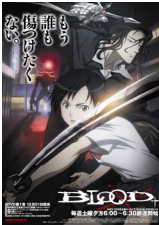
Figure 2: Blood+ poster with Saya and her chevalier Hagi © Production I.G. The poster reads “I don't want to hurt anyone every again”

Like many Japanese anime, Blood+ deals in part with loyalties and the violence of war. Although some anime, such as Space Battleship Yamato , offered fairly black and white portrayals of “good guys versus bad guys,” since then we find more often the elaboration of gray areas in battle. The original Mobile Suits Gundam series (1979), for example, produced as many fans of Char Aznable, the warrior for the Zeon rebels, as for Amuro Rei, defender of the Earth Federation. That pivotal series stood out for the “reality,” as the creators and fans viewed it, in the portrayal of fear, anxiety, and moral dubiousness of war (Otsuka and Sakakibara 2001: 204-207). The heartbreaking classic film Grave of the Fireflies directed by Takahata Isao (1988) also suggests that a proper historical understanding of war is not “who fought whom,” but how the suffering was extraordinary, and meted out on civilians as well as soldiers. Since Gundam , one of anime’s attractions has been this willingness to explore the multiple dimensions of war’s brutality.