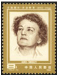
Agnes Smedley (Chinese postage stamp)

Last, but not least, Shanghai embodied the conflicts and contradictions of capitalist development. The considerable flow of people, ideas, goods and capital throughout East Asia and the world was enabled by the capitalist-imperialist development of cosmopolitan, urban centers like Shanghai, Tokyo, and Dalian (Dairen). Shu-mei Shih writes: Shanghai "was a semicolonial city integrated with global economy and politics though the efforts of an economy-driven Euro-American imperialism and a territorially and economically ambitious Japanese imperialism; it was a city of sin, pleasure, and carnality, awash with the phantasmagoria of urban consumption and commodification." [16] According to Raymond Williams, the development of European modernism "had much to do with imperialism: with the magnetic concentration of wealth and power in imperial capitals and the simultaneous cosmopolitan access to a wide variety of subordinate cultures." [17] A semicolonial matrix of capital, Shanghai was likewise host to a nexus of engaged and experimental Chinese writers. [18]