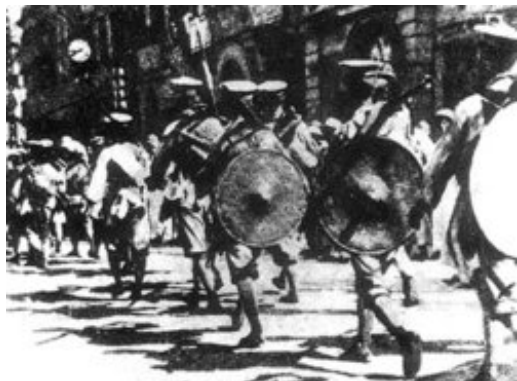
National Revolutionary Army forces enter the British Concession, Hubei, 1927.

Soviet-devised Communist strategies in China focused on national revolution before social revolution: “[T]he Politburo of the Soviet Communist Party... calculated that China faced not a socialist revolution, but a national revolution against imperialism and warlordism, and that the GMD [Guomindang] was the main force capable of achieving this... From 1923 the Politburo poured massive amounts of military, financial and organizational aid into the GMD and the NRA [National Revolutionary Army].” [44] The alliance between the Communists and Guomindang, which initially gave the former access to the worker and peasant masses, ended in disaster for the Communists, as we have noted, but until that happened the Chinese Communist Party was pressed by Soviet strategists to maintain a united front with the nationalists in a joint effort to reunite the country and repel Japanese imperialism. S. A. Smith writes, “The CCP [Chinese Communist Party] and left GMD used the Northern Expedition to carry out a remarkable political and ideological mobilization of the rural and urban masses. By spring 1927 more than fifteen million peasants were organized into peasant associations which fought to reduce rents and interest rates; whilst in urban centers workers launched strikes and joined labour unions.” [45]