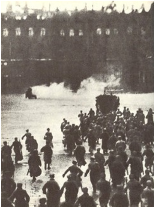
Image from the Bolshevik Revolution, 1917