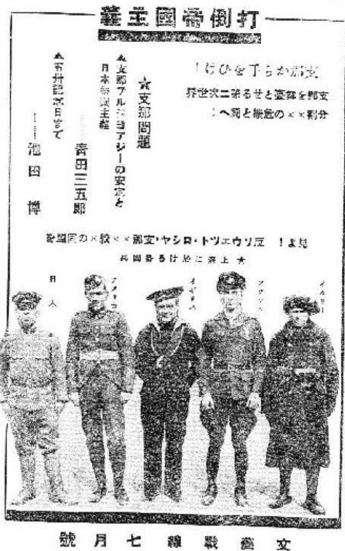
Photo collage from Bungei sensen showing five imperialist nations vying for control of China: Japan, American, England, France and Italy. Headlines read, "Get your hands off China!" and "The stage will be set for WWII in China." The Chinese header reads "Down With Imperialism." (July 1929)

The goal of proletarian revolution—and the quest for a just future—brought together people whose lived experience was diverse, and as a result, the art and literature that was produced was also diverse. The proletarian arts movement was built by thinkers, activists, artists and writers whose world resembled ours with war, imperialism, uneven economic growth, and culture wars. It should then come as no surprise that proletarian arts address the most important issues of our day: the transformations of the world through capitalism, the possibilities of democracy, job security, nationalism, imperialism, sweatshops, torture, living wages, child care, relations between the sexes, the social function of the family, the arts and media, war, peace and empire, and so much more.