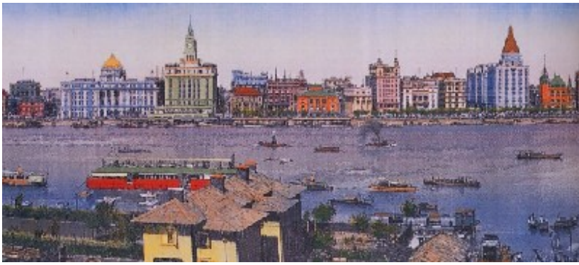
The Bund in Shanghai in the 1920s

Shanghai was also the site of the Guomindang's betrayal of its united front ally, the Chinese Communist Party, in 1927. [11] In 1927, Chinese Communists sought to mobilize thousands of Shanghai workers in general strikes into an uprising capable of unseating the warlord Sun Chuanfang before Chiang Kai-shek's army could arrive in Shanghai during the Northern Expedition. All three attempts at uprisings failed; the third because Chiang's army did arrive and itself massacred workers and Communists.