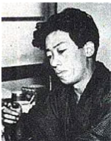
Kobayashi Takiji, subject of symposia in Tokyo and China

This essay offers an introduction to proletarian arts in East Asia in the 1920s and 1930s through a discussion of context and key issues such as modernism, communism, nationalism, imperialism, gender and representation, as well as attention to work on proletarian literature by contemporary scholars from around the world. It is based on the introduction to a special edition of positions: east asia cultures critique, Proletarian Arts in East Asia: Quests for National, Gender, and Class Justice 14:2 (Fall 2006), which grew out of the symposium at the University of Chicago in 2002. [2]