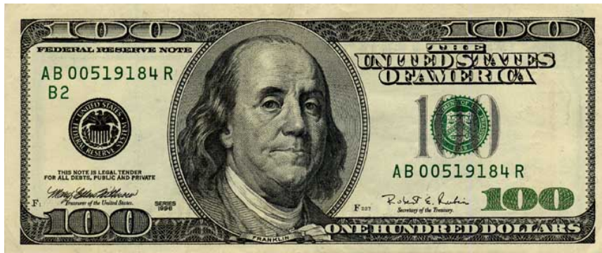
US 100 dollar supernote