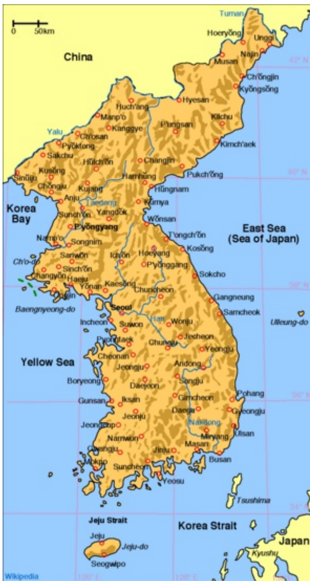
Map of the Korean Peninsula