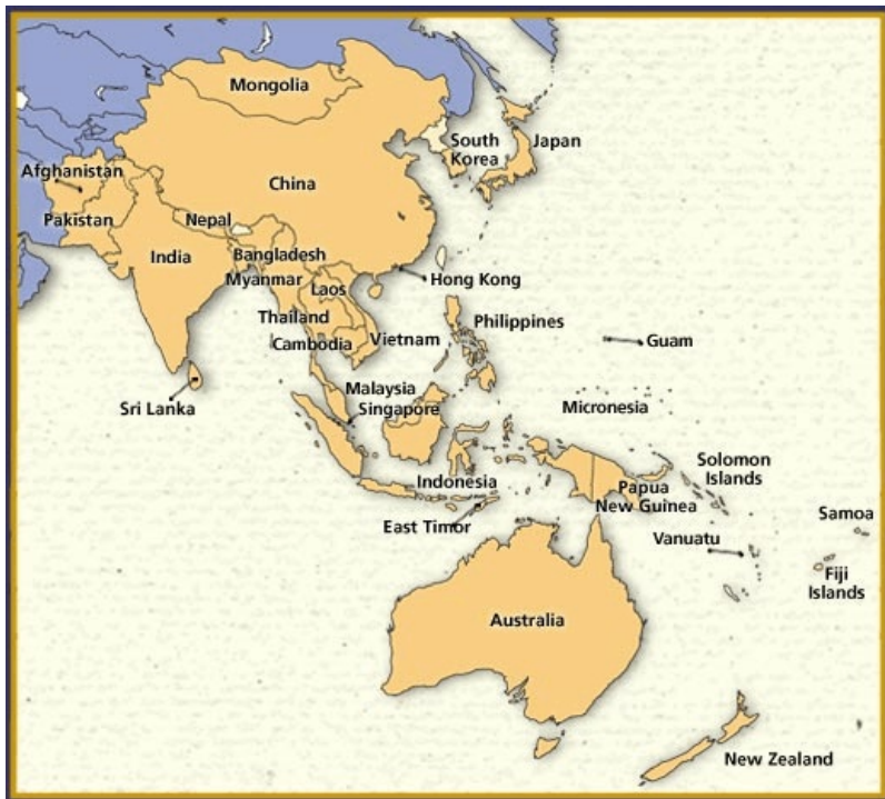
Map of the Western Pacific

Despite centuries of subjugation by larger neighbours—Joseon Korea, Imperial Japan, and South Korea—Jeju island society has maintained a distinct identity and a measure of autonomy. Relations with both Korea and Japan have at times had devastating effects on the islanders, but also contributed to the dynamism of Jeju island society and opened up new routes for islanders to continue traveling as a vital part of their social life.