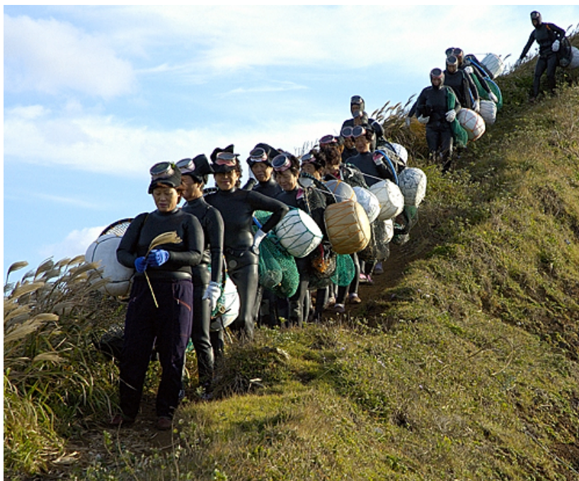
Contemporary Jeju women divers

Although Jeju Islanders' early efforts at resisting Japanese incursions into their fishing areas failed and they moved on to adapting to the new political situation, more bursts of resistance against Japanese rule followed in the 1930s (Yang 1996). Jeju's women divers played a key role in some of these movements (Fujinaga 1989). By then they had fishing rights to the whole Korean peninsula and were used to organizing themselves economically, so although they had no formal schooling, it was a small step for them to form groups to actively agitate for change in areas where their rights were abused.