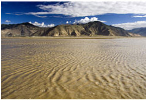
The Yarlong Tsangpo River in Tibet

While intrastate water-sharing disputes have become rife in several Asian countries — from India and Pakistan to Southeast Asia and China — it is the potential interstate conflict over river-water resources that should be of greater concern. This concern arises from Chinese attempts to dam or redirect the southward flow of river waters from the Tibetan plateau, where major rivers originate, including the Indus, the Mekong, the Yangtze, the Yellow, the Salween, the Brahmaputra, the Karnali and the Sutlej. Among Asia's mighty rivers, only the Ganges starts from the Indian side of the Himalayas.