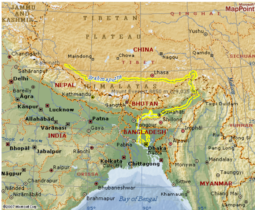
Yarlong-Tsangpo/ Brahmaputra River in Tibet and South Asia

While intrastate water-sharing disputes have become rife in several Asian countries — from India and Pakistan to Southeast Asia and China — it is the potential interstate conflict over river-water resources that should be of greater concern. This concern arises from Chinese attempts to dam or redirect the southward flow of river waters from the Tibetan plateau, where major rivers originate, including the Indus, the Mekong, the Yangtze, the Yellow, the Salween, the Brahmaputra, the Karnali and the Sutlej. Among Asia's mighty rivers, only the Ganges starts from the Indian side of the Himalayas.