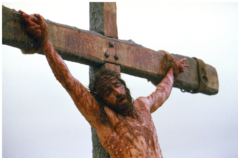
The Passion of Christ