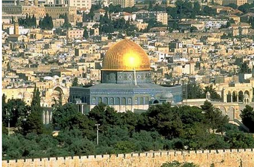
The City on a Hill

For our conversation, fundamentalist Christianity is a perfect paradigm within which to understand what's been happening in America, a profoundly Christian super-culture. America is also a secular nation, of course. The separation of church and state was a critical innovation, giving us this special standing as a people. The separation's purpose was to protect the conscientious freedom of every individual by making the state neutral on questions of religious conscience. An absolutely ingenious insight.