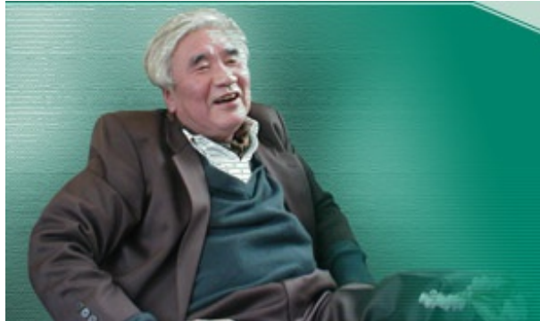
Oda Makoto at 75

On 30 July, 2007, social and political critic, novelist and political activist Oda Makoto died in Japan at the age of 75. Throughout his life, he published numerous essays and more than 100 books including some thirty novels. Two of his novels, Hiroshima and Gyokusai (The Breaking Jewel), have been translated into English and dramatized for a BBC radio program and broadcast worldwide. In Japan, however, he is remembered above all as the political activist who founded and led Beheiren (Japan Peace-for-Vietnam Citizen's Alliance), a major grassroots movement against the Vietnam War, which gained extraordinary popular support in the 1960s and 1970s.