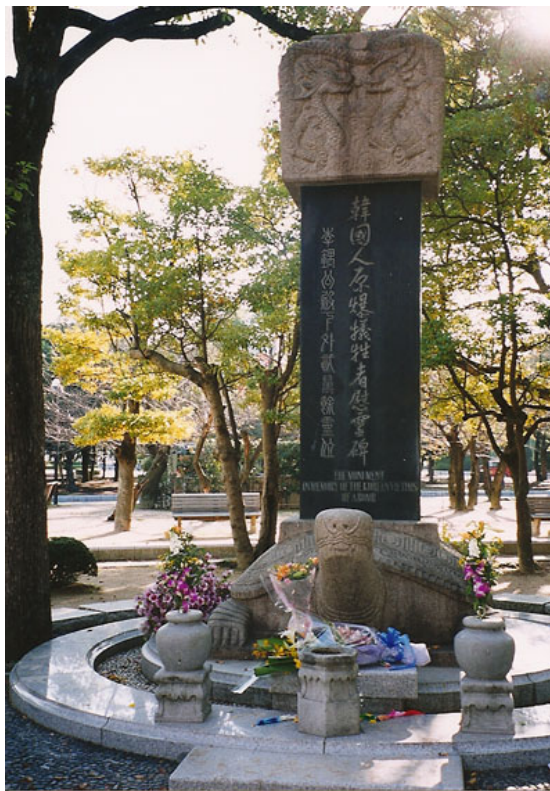
Memorial for the Korean victims of atomic bombing in Hiroshima