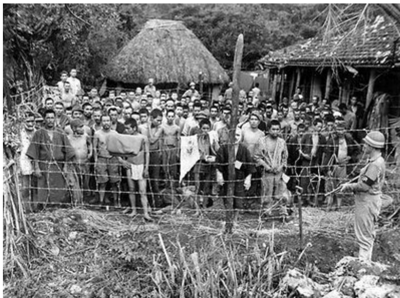
A Marine guards Japanese prisoners of war after the Battle of Okinawa. More than 148,000 civilians died in the campaign.

The extreme fear of "brute Americans and British" [cultivated by the Japanese military] was a factor that made people choose death. Japanese military experiences of slaughter of Chinese people on the continent since the "Manchurian Incident" was widely discussed; and about the fate of residents at large at the time when the war turned out to be a "losing battle", people despaired anticipating plunder, violence, slaughter by the American military. There were returned migrants who thought "the American military can no way be expected to kill residents", but returnees were regarded as suspected spies and hence were unable to speak positively. To make such a statement was to court denunciation as a spy and slaughtered.