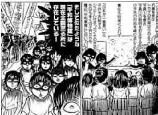
Kobayashi denounces the brain-washing of children at peace museums

The views emanating from this reassessment of Japan's past and its role as a source of national pride and identity became widely available and popularized by the late-1990s and can be summarized as follows: i) it is natural and healthy to love one's country, and Japanese people should be proud of Japan; ii) post-war Japanese public discourse had been dominated by the left, which has presented a "distorted" and "masochistic" history to the public and children in particular;