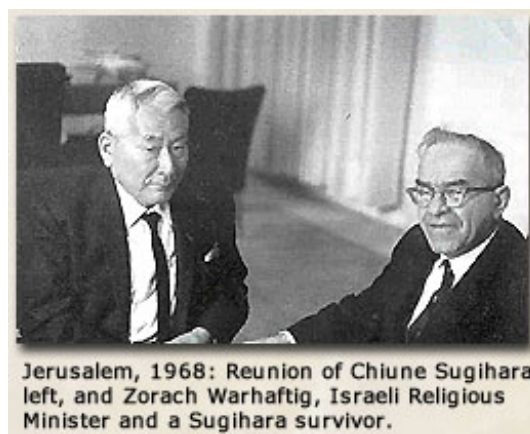
Jerusalem, 1968: Reunion of Chiune Sugihara, left, and Zorach Warhaftig, Israeli Religious Minister and a Sugihara survivor.

The Japanese life story of Sugihara Chiune would contain yet another unexpected development. In 1968, Sugihara's past caught up with him. One of the Jewish refugees he had saved by issuing the transit visas—an Israeli civil servant—located him. In 1969, the Israeli Minister of Religion—another refugee saved by Sugihara's visas—invited him to Israel and awarded him the Israeli Ministry of Religion Prize for his actions during the war.