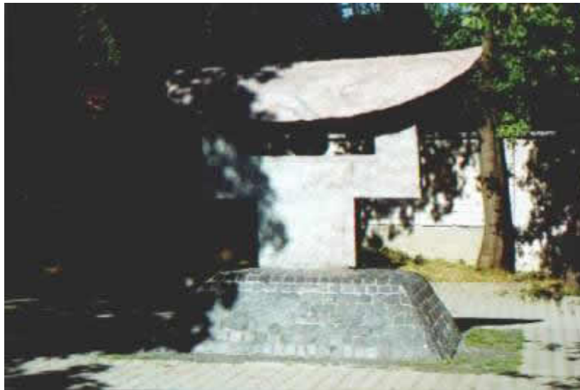
Sugihara Memorial in Vilnius, Lithuania

The main event, which the entire life story of Sugihara is assembled to highlight, is his act of issuing the life-saving transit visas to the Jewish refugees. Indeed, there are few other critical events in the story. As articulated in the previous section, his role in securing the purchase of the Manchurian railroad is described in some detail; likewise, the story touches on his various positions as diplomat, government official, and Russian specialist, at times even hinting that he worked as a spy. The narrative leaves no room for doubt, however, that the main event—the event for which Sugihara deserves to be recognized as a great man, and for which he should be remembered—is his act in Lithuania of saving Jewish refugees.