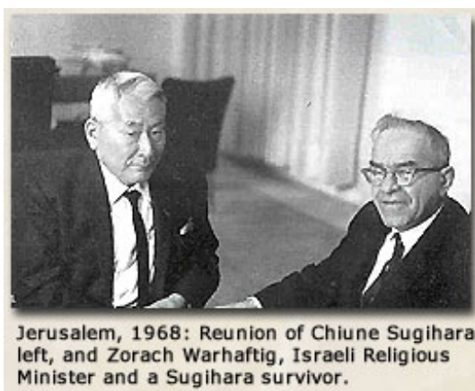
Jerusalem, 1968: Reunion of Chiune Sugihara, left, and Zorach Warhaftig, Israeli Religious Minister and a Sugihara survivor.

The Japanese life story of Sugihara Chiune would contain yet another unexpected development. In 1968, Sugihara's past caught up with him. One of the Jewish refugees he had saved by issuing the transit visas—an Israeli civil servant—located him. In 1969, the Israeli Minister of Religion—another refugee saved by Sugihara's visas—invited him to Israel and awarded him the Israeli Ministry of Religion Prize for his actions during the war.