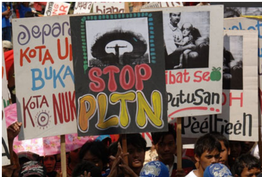
Rally followed the Ulama fatwa declaring the Muria site haram .

According to a Stockholm International Peace Research Institute SIPRI report, Indonesia has largely succeeded in creating an “indigenous fuel cycle.” Although only conducted at the laboratory level, evidence indicates that Indonesia is active in uranium milling, processing and conversion. Its nuclear research program spans five decades. Three research reactors are in operation with a fourth planned. Indonesia hosts at least two uranium mines capable of supplying sufficient yellowcake to service domestic needs for planned reactors. While Indonesia operates under IAEA safeguards, SIPRI’s stated concern is that given the questionable security of the management of nuclear waste, “it is conceivable that terrorist organizations could utilize its spent waste in a radiological device (“dirty bomb”). [15] Perhaps of greater concern is the combination of unstable geological conditions and dubious safeguards to control the technology.