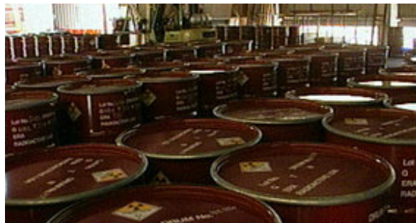
Indonesia plans to expand its fledgling nuclear industry

According to a Stockholm International Peace Research Institute SIPRI report, Indonesia has largely succeeded in creating an “indigenous fuel cycle.” Although only conducted at the laboratory level, evidence indicates that Indonesia is active in uranium milling, processing and conversion. Its nuclear research program spans five decades. Three research reactors are in operation with a fourth planned. Indonesia hosts at least two uranium mines capable of supplying sufficient yellowcake to service domestic needs for planned reactors. While Indonesia operates under IAEA safeguards, SIPRI’s stated concern is that given the questionable security of the management of nuclear waste, “it is conceivable that terrorist organizations could utilize its spent waste in a radiological device (“dirty bomb”). [15] Perhaps of greater concern is the combination of unstable geological conditions and dubious safeguards to control the technology.