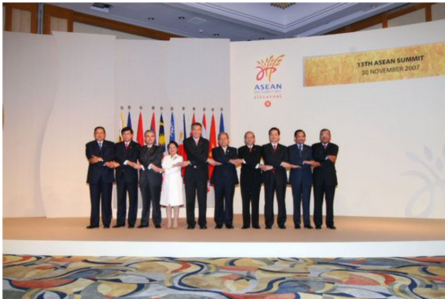
The 13th ASEAN Summit meeting held in Singapore in November 2007

The 2005-07 spike in petroleum prices topping out at $100 a barrel has prodded economic planners across the globe to reconsider their energy options in an age of growing concern over global warming and carbon emissions. The Southeast Asian economies, themselves beneficiaries of an oil and gas export bonanza through the 1970s-1990s, also find themselves in an energy crunch as once ample reserves run down and the search is on for new and cleaner energy supplies. Notably, regional leaders at the 13 th ASEAN Summit meeting held in Singapore in November 2007 issued a statement promoting civilian nuclear power, alongside renewable and alternative energy sources. ASEAN--which in 1971 endorsed a nuclear-free zone concept--also sought to ensure that plutonium did not fall into the wrong hands through the creation of a "regional nuclear safety regime." In response, environmental activists across the region cited concerns over nuclear power, citing safety and unstable regional geologies concerns. [1] Undoubtedly they were taking a cue from Japan's recent nuclear disaster. [2] Singapore, host of the ASEAN summit meeting, made known its concerns.