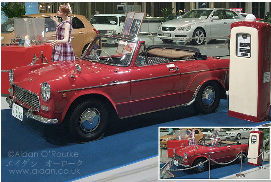
1960s Toyota Publica

Japan and Korea do not any longer combine “low incomes and low wages with significant innovative potential” – the third of the “distinct” challenges that China and India are said to pose. But that was arguably the case fifty years ago when Japan had a per-capita GNP that is smaller than China’s today at a time when the likes of Sony were seizing on the commercial potential for the transistor. One can accept that “China and India are associated with very different forms of regional integration” – the fourth so-called “distinct challenge.” But the picture the authors present of China’s integration – “the processing of imported raw materials and intermediates” -- has long also characterized Japan’s and Korea’s economic ties with the rest of the region.