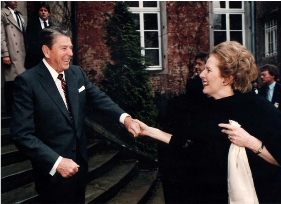
Reagan and Thatcher

This all provoked a worldwide fascination compounded of equal parts envy, resentment, and a burning desire to understand how Japan did it – nowhere more obviously than in the developing economies of Asia. Most particularly, this was because Japan seemed to have pulled it off by thumbing its nose at the two dominant development paradigms of the day: the “let the markets rip” neoliberal paradigm coming into ascendancy in the West with the elections of Margaret Thatcher and Ronald Reagan, and the Marxist/Leninist paradigm crumbling in the face of the ever-more-obvious sclerosis of the Soviet Union and from the repeated economic disasters inflicted on China by the recently deceased Mao Zedong. Japan seemed to demonstrate that a powerful bureaucracy could remain in control of economic outcomes while harnessing market forces to engineer a spectacular rise to global pre-eminence. The effect of this demonstration on the likes of Singapore’s Lee Kwan Yew and Malaysia’s Mahathir Mohamad – not to mention the Chinese leadership – can hardly be exaggerated.