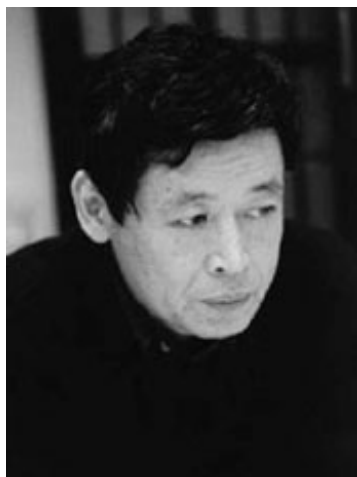
Karatani Kojin and the shift to activism in the 90’s

Important continuities exist between Yoshimoto and younger thinkers like Asada Akira, who follows Yoshimoto in arguing that freedom or autonomy is more effectively pursued by going along with the “schizoid” tendencies in post-industrial consumer capitalism itself, especially what he (following Deleuze and Guattari) calls the culture of “flight”, than through moralistic criticism or political confrontations. The paradox which I pointed to in Yoshimoto – how can going along with the system count as resistance? – reappears in Asada, who has admitted that he is unable of coming up with a solution (Asada 1984:80f). Furthermore, he recognizes that the possibility of “flight” is constrained by the imperatives of making a profit inherent in capitalist production. A full liberation of the powers of flight would require a break with such production, but Asada fails to take this decisive step in his work. This idea will be developed further by Karatani, in whose writings we see the idea of flight as a break with the capitalist economy, and in which a firm link is established between the rhetoric of exit and social movement activism.