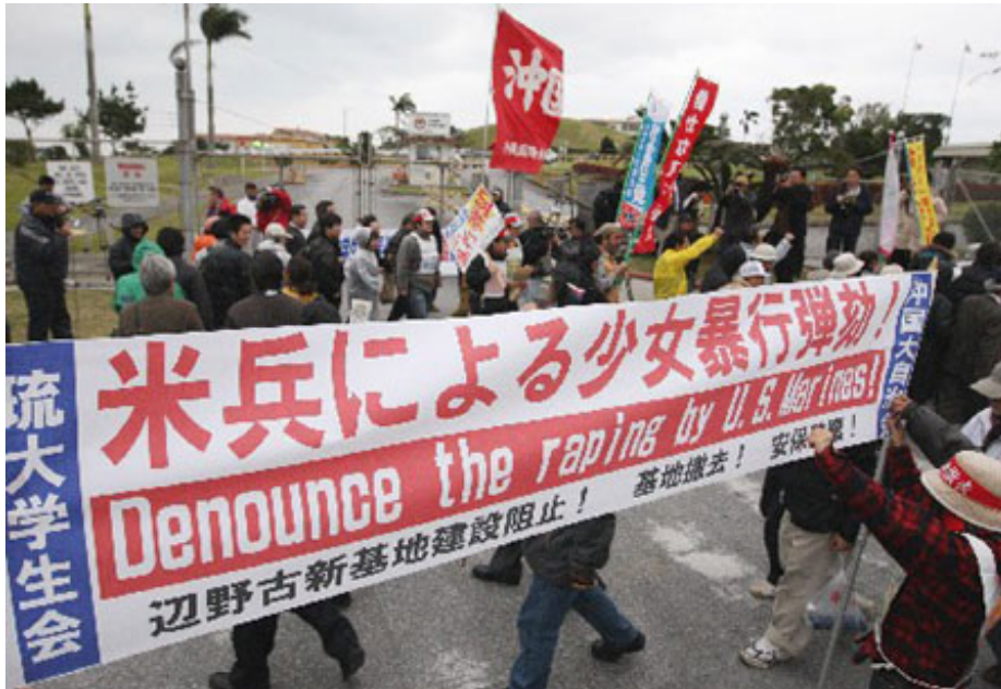
Okinawan protest at Marine Headquarters in Kita Nakagusuku village following news of the rape

Once an incident "blows over", as this latest one now has, the pundits and diplomats go back to their boiler-plate pronouncements about the "long-standing and strong alliance" (Rice in Tokyo), about how Japan is an advanced democracy (although it has been ruled by the same political party since 1949 except for a few years after the collapse of the Soviet Union), and about how indispensable America's empire of over 800 military bases in other people's countries is to the maintenance of peace and security.