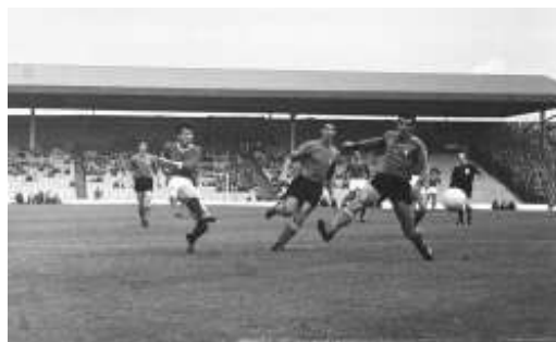
Pak Doo-ik kicks North Korea's winning World Cup goal against Italy

In fact, during the 1960s and 1970s the South Korean government of President Park Chung-hee used sports promotion as one of several means to create a national revival in the wake of the traumas of colonization and war. Labelled by some as the 'father of modern sport', Park introduced a number of innovative sports policies at both the elite and mass level and the idea of hosting the Olympics originated during his years in office. In North Korea too sporting activity became an important part of societal mobilization and development. Mass sports involving gymnastics became a regular feature of North Korean society. Nonetheless, throughout the 1960s and 1970s both Koreas remained relatively low-key in terms of participating in international sporting events, with the notable example of the North Korean soccer team's almost legendary exploits in the 1966 World Cup in England.