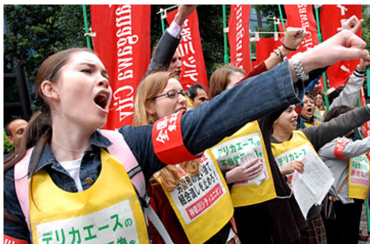
Foreign workers protest working conditions at Nova Schools in 2007

More on street petitioning in Japan here .