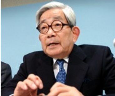
Oe at March 28, 2008 press conference following the verdict

On March 28, 2008, the Osaka District Court dismissed a lawsuit against Nobel Prize-winning author Oe Kenzaburo and his publisher for publishing accounts of the Japanese military ordering “group suicides” of civilians during the Battle of Okinawa. The plaintiffs, a former garrison commander and the brother of a late former commander, had claimed the descriptions in Oe’s Okinawa Notes (Okinawa Noto, Iwanami Shoten, 1970) and in the late Ienaga Saburo’s The Pacific War (Taiheiyo Senso, Iwanami Shoten, 1968; translation, Pantheon, 1978) were defamatory.