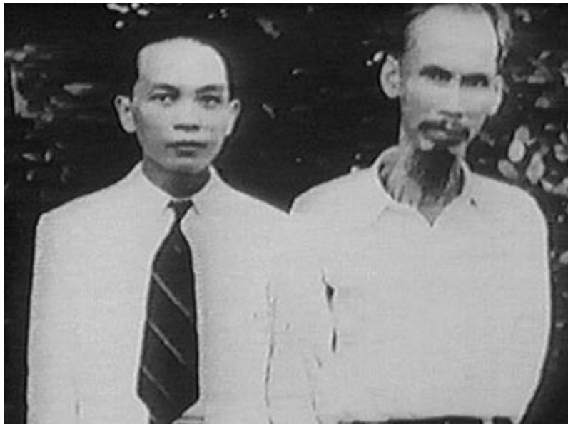
Vo Nguyen Giap and Ho Chi Minh

The asymmetry of their forces with Nato's may be even greater than with the respective sides in Vietnam (even if the alliance pleads shortages of helicopters and other equipment). Yet the recent experience of the anti-Soviet struggle, the emergence of a new generation of military commanders, and - perhaps above all - the mobilisation of centuries-old memories of opposition to foreign occupations, are potent weapons in the Taliban armoury.