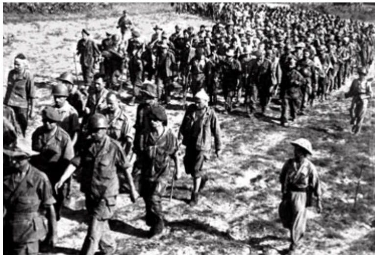
French forces surrender at Dien Bien Phu

These three stories together portray a very different picture of the strategic predicament of the United States and its allies in Afghanistan (and Iraq) from the optimistic comments of Brigadier-General Carlos Branco - and perhaps a more accurate one. In 1954, the French gave up in the face not just of "external" pressure and setback but of an "inner" corrosion of their resolve.