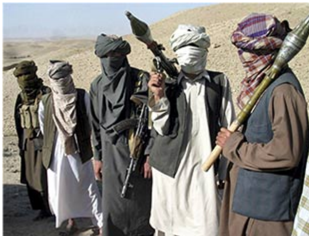
Taliban forces in Afghanistan

The first reports a claim that British forces in southern Afghanistan have killed as many as 7,000 Taliban - and no less than 6,000 of them since January 2007 (see Michael Smith, "Army Has Killed 7000 Taliban", Sunday Times, 13 April 2008). The human costs of this carnage are grave enough, but leaving that aside it might be assumed that the figure is regarded as a sign of military success. Not so: the story reflects an intelligent recognition that deaths on this scale "are a boost for the Taliban when fighters recruited from the local population are killed, as the dead insurgent's family then feels a debt of honour to take up arms against British soldiers." The assessment, put bluntly, is that killing Taliban makes even more enemies.