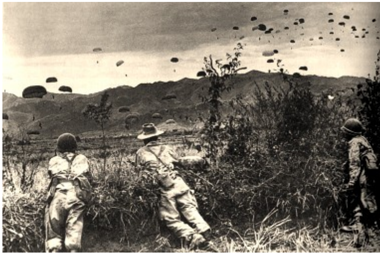
French airborne assault to defend Dien Bien Phu

It was a move too far. The French did not have the resources to supply Dien Bien Phu by air; the Vietminh controlled the access routes, and mounted an epic effort to transfer supplies (a huge amount of them by bicycle) across densely forested and mountainous tracks to encircle and besiege the French forces.