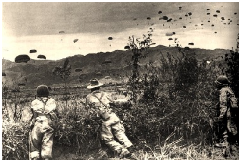
French airborne assault to defend Dien Bien Phu

It was a move too far. The French did not have the resources to supply Dien Bien Phu by air; the Vietminh controlled the access routes, and mounted an epic effort to transfer supplies (a huge amount of them by bicycle) across densely forested and mountainous tracks to encircle and besiege the French forces.