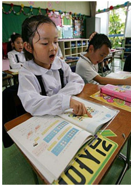
Ethnic Korean students study at a Chongryun-funded elementary school in Tokyo. 2007.

In short, by 1955, within three years of being deprived of Japanese citizenship, Koreans in Japan (or at least Chongryun and its affiliates, which accounted for the majority of Koreans at the time) had banished or exiled themselves from the Japanese civic terrain. During the period when their status had been ambiguous, that is to say, in 1949, when they were not legally excluded from Japanese citizenship status under the Occupation, they were “outlawed”; in 1952, they were excluded from Japanese civic entitlements; in 1955, Koreans themselves embraced this marginalization by effectively declaring that they had no wish to be counted within Japan’s civic life.