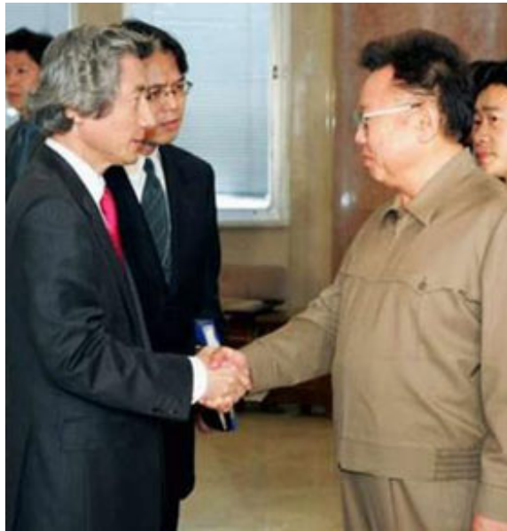
Koizumi and Kim Jong Il

But in 2002, the abduction narrative in Japan swerved suddenly from the margins to the very center of the policy debate. Japanese Prime Minister Koizumi Junichiro visited Pyongyang on September 17, 2002 in an attempt to break the logjam of non-recognition in Japan-North Korea relations. In the course of that visit, Koizumi extracted a confession and an apology from North Korean leader Kim Jong Il. North Korea had abducted Japanese citizens. It was as if a UFO had landed in downtown Tokyo and the earth stood still for the Japanese. A narrative nurtured by a relatively small group of Japanese, particularly the families of the disappeared, had turned out to be true.