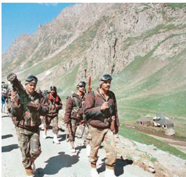
Indian forces in Kargil.

Nuclear weapons advocates have always promised that nuclear weapons would prevent war, if not bring peace. The simple argument was that fearing destruction by the other side's nuclear weapons, no country would risk war. Within a year of the tests, however, India and Pakistan went to war in the Kargil region of Kashmir. Although geographically limited, the war claimed perhaps several thousand lives.