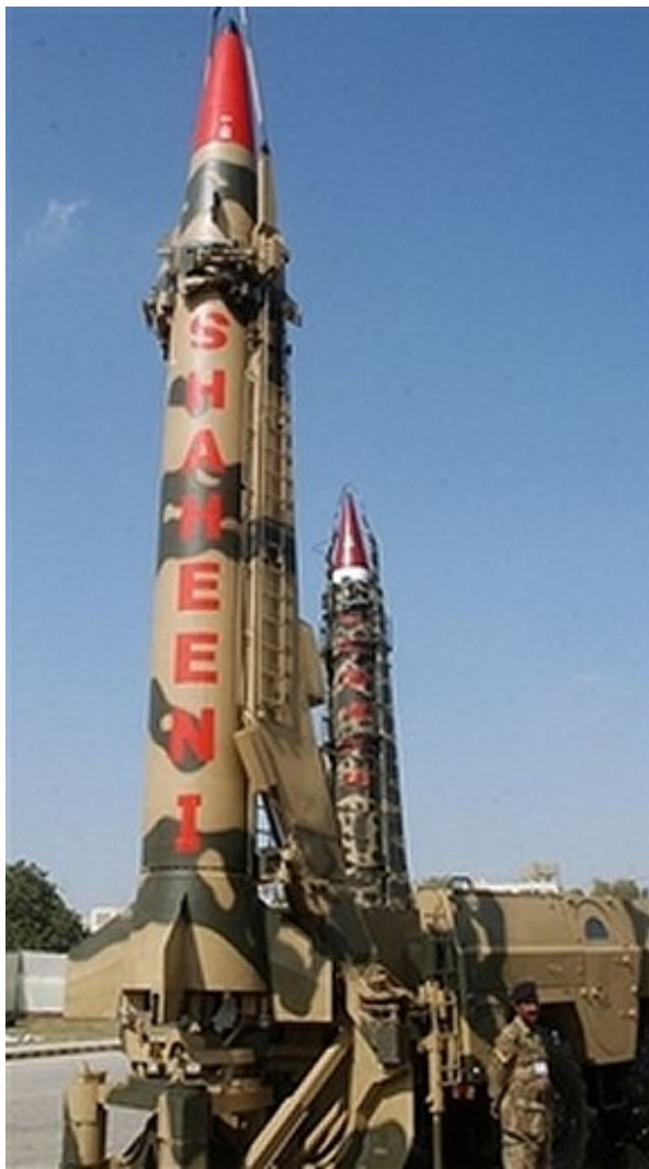
A Shaheen missile.

Though the short-range Ghaznavi was said to have entered service in 2004, it was only in 2006 that it was declared ready for operations. The solid-fueled Shaheen comes in two varieties, a short-range Shaheen-1 and a medium-range Shaheen-2. The latter was flight tested on February 23, 2007, to a range of 2,000 km. The liquid-fueled Ghauri, derived from a North Korean missile, was first tested in April 1998, a month before the nuclear weapon tests. Recent Pakistani missile tests have been carried out by the various strategic missile groups (each equipped with a particular type of missile) of the army's strategic force command and are described as "field exercises." The 1,300 km-range Ghauri missile and the 700 km-range Shaheen-1 were tested by the army strategic force command in 2006. The first test launch of the Shaheen-2 missile by an army strategic missile group was carried out in April 2008 (AP 2008).