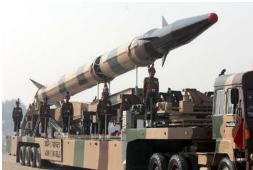
An Agni missile.

The main land-based nuclear delivery system is the Agni series of missiles. Work on the Agni started as part of the Integrated Guided Missile Development Program in 1983, but the missile has been substantially redesigned since the 1998 nuclear tests. The early Agni had both solid and liquid propellants and was never deployed.