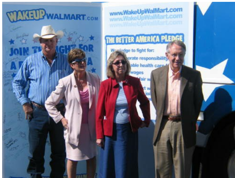
Congresswoman Shelly Berkley (second from the left), 2006