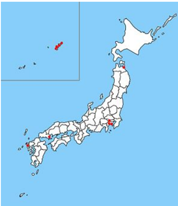
US bases in Japan