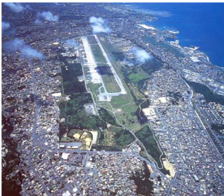
Futenma Base in crowded Ginowan

The US freely decides what weapons and bombs will be brought into the bases, what training is conducted, and which wars to fight. Japan upholds the three non-nuclear principles of 'nonpossession, nonproduction, and nonintroduction'. This also applies to Okinawa. The reality, however, is unclear. Japanese government officials cannot enter bases to confirm whether there are nuclear weapons or not.