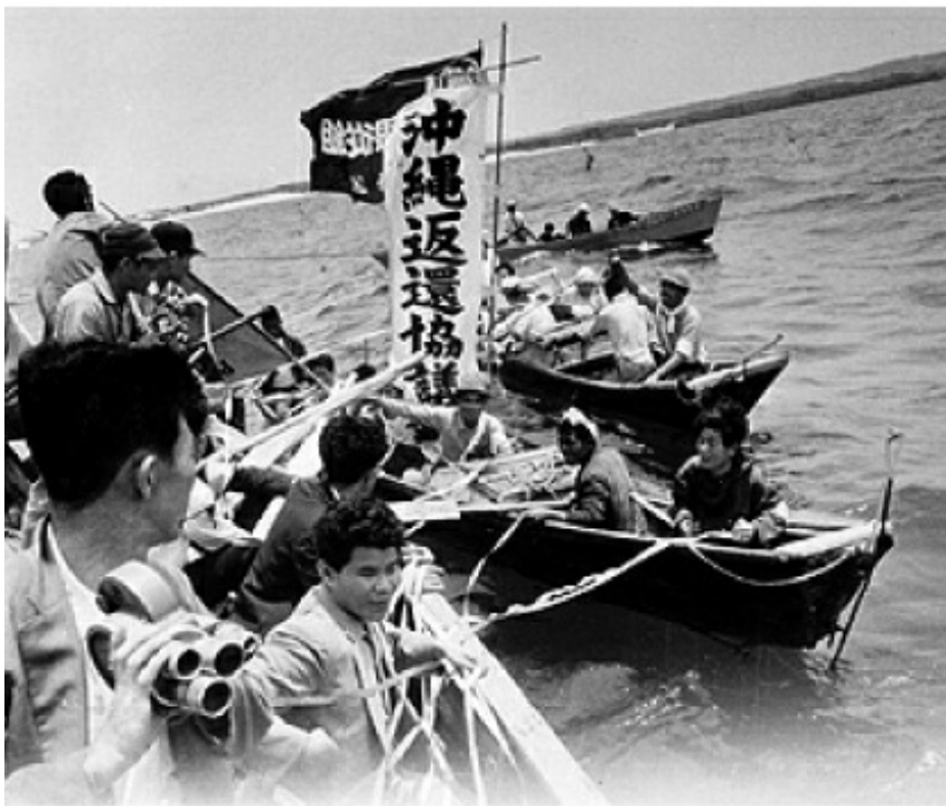
Figure 4. 4.28 Rally at Sea (4.28 kaijō shūkai ) at the 27th Parallel Border