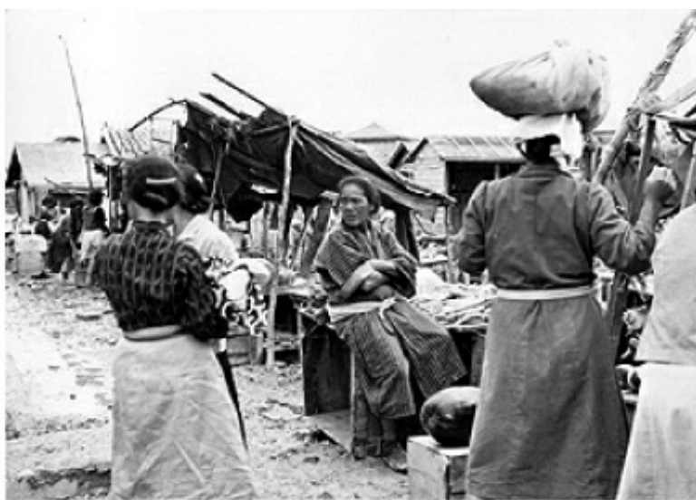
Figure 3. Black Market Scene in Naha, Okinawa, circa 1948

The appropriation of surplus supplies from US military depots was followed by its redistribution in Okinawan society, usually through the black markets, but also through kinship networks. Okinawan employees at military bases often shared their hard-won senka with their friends and family, but they sold the bulk of their goods to black market brokers who traded them with other smuggled commodities for a profit. A popular Ryukyuan poem captures the distribution of labor in this underground trade, reflecting social conditions in Okinawa at the time: "best pickings at the top, black markets in the middle, we at the bottom must win senka ." In other words, the upper class clung to the US military for access to power and prestige, the middle class could secure a decent living by trading black market goods, so the lower class was left to fend for themselves in pursuit of senka . [32] In general, most of the senka was supplied by those who worked inside or lived nearby the major military bases in central Okinawa, then flowed into the thriving black markets in southern Okinawa. The emergence of new social classes in postwar Okinawa thus developed simultaneously with the geographical distribution of the US military bases and black markets.