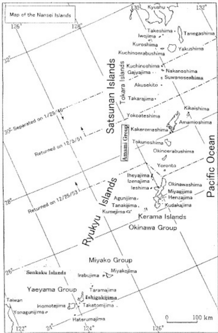
Figure 1. Map of the Nansei Islands

While the Ryukyus were denied the far-reaching democratic reforms implemented in Japan, Murray recognized the value of a limited form of self-government to win Okinawan acquiescence to US military rule. As a result, on September 20, 1945 the military government held elections for mayors and assemblymen in the sixteen military government districts.[11] Another major event in the political rehabilitation of the Ryukyus was achieved on April 24, 1946 when Shikiya Koshin, a respected local educator, was appointed civilian governor – a post denied to Okinawans under Japanese rule. Governor Shikiya expressed the hopes of many Okinawans when he stated in his inaugural speech that, “in striving to build a better Okinawa than before, we will achieve the golden age for Okinawa with our hands.”[12] Such reform measures, however, masked the fact that mayors, assemblymen, and governors in the Ryukyus were directly under the control of the US military government. The limits of political power in the Ryukyus were apparent in contrast to occupied Japan, where the local, regional, and central government exercised greater authority in interactions with US occupation officials.