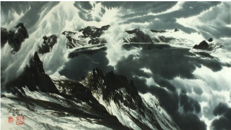
"Mt. Baekdu in May" by Choi Chang-ho, 2008