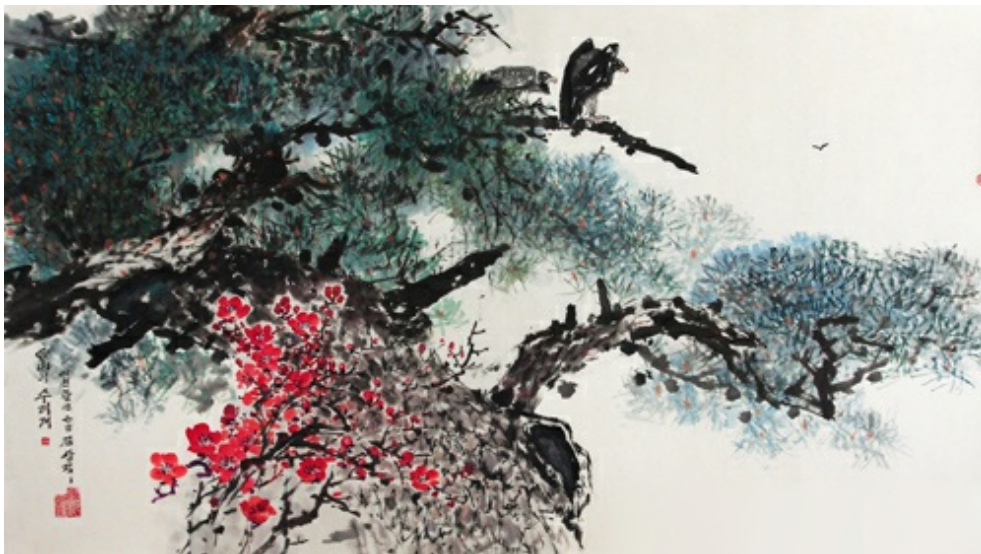
"Eagle of Mt. Baekdu" by Kim Sang-jik, 2008

First, many of the seemingly apolitical subjects have specific ideological implications. For example, Mount Baekdu, the worshipped site of Korea's mythical foundation, can be seen in numerous pictures, in varying styles and from different perspectives. According to his official biography, however, Mount Baekdu is also the birthplace of Kim Jong-il.