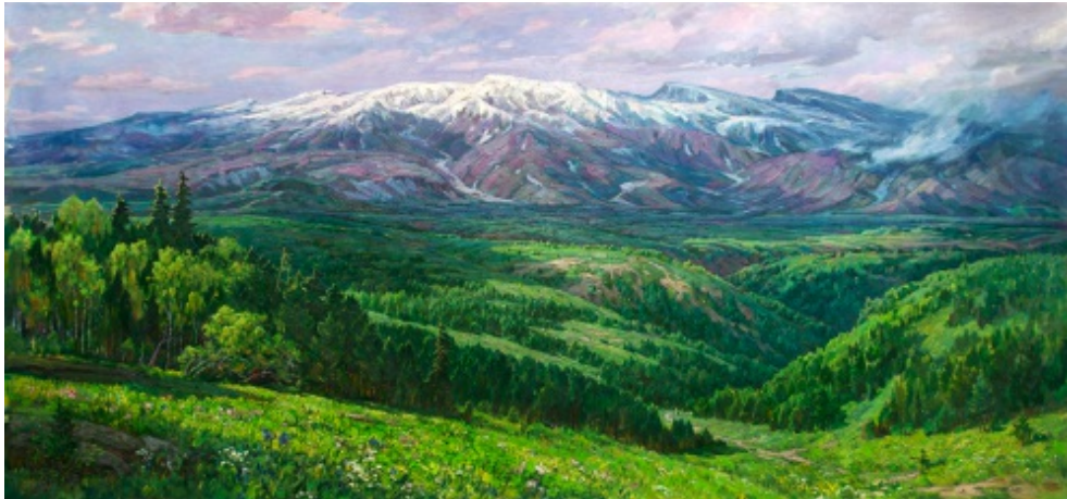
"Mt. Baekdu in June" by Kim Myong-un, 2006

(For additional images see The Gallery Pyongyang website .)