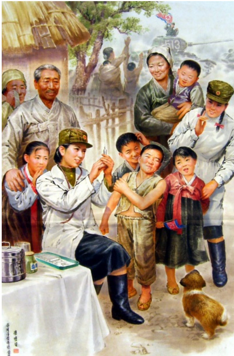
"Day of vaccination" by Jong Myong-il, Juche 96 (= 2007)