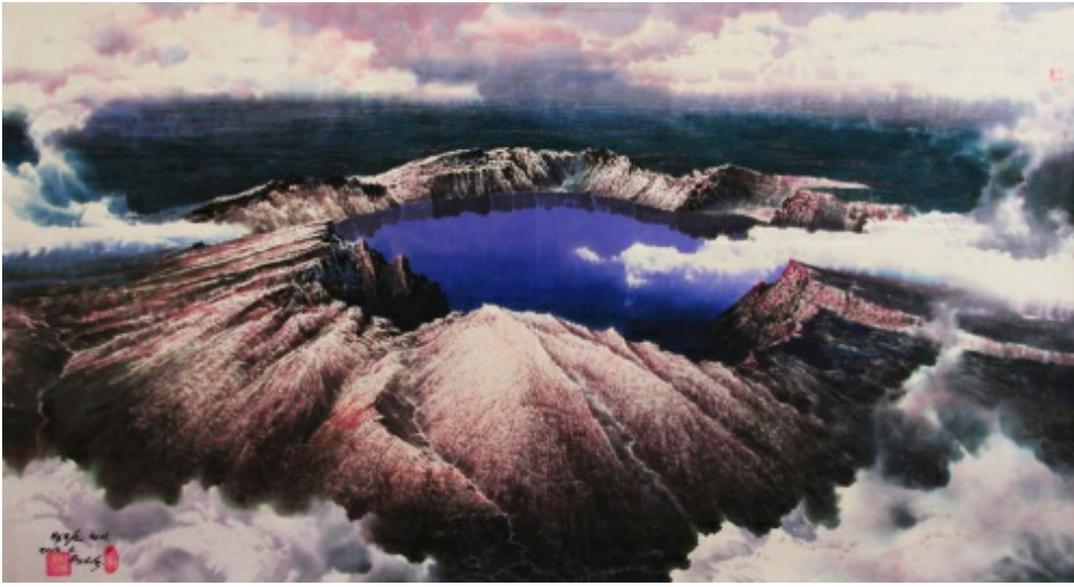
"Lake of Mt. Baekdu" by Bang In-su, 2008