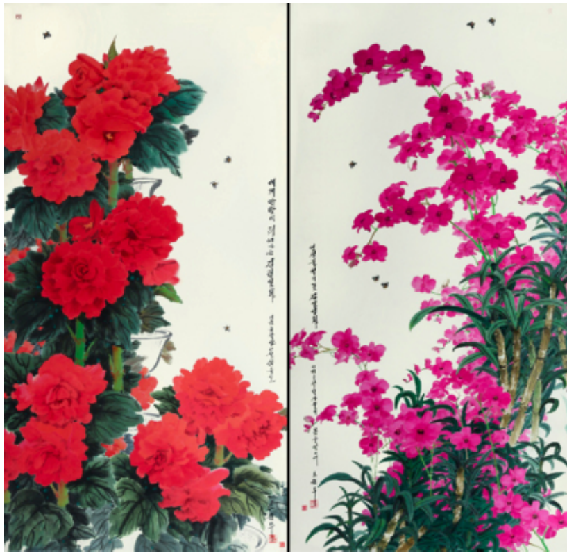
"Kimjongilia" and "Kimilsungia" by Cho Won-du, 2008