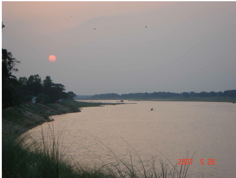
A view of the Brahmaputra River

Asia will continue to have the largest number of people without basic or adequate access to water. Such water stress in the face of rising demand and poor water management will sharpen competition between urban and rural areas, between neighboring provinces and between nations. As global warming accelerates, local, national and interstate disputes over water will become increasingly common in Asia, making cooperative institutional mechanisms over water resources essential within and between states.