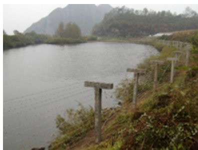
Dandong. Barbed wire fence separates China from North Korea (left)