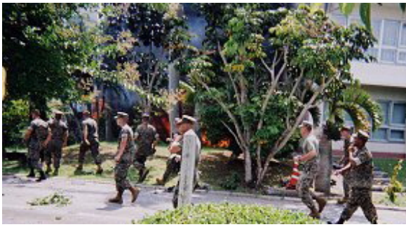
Marines occupy Okinawa International University campus

The incident is telling as to how the US military understands its status in foreign countries. That is, it will obey the status of forces agreements when it's no big inconvenience, but in the case of a crisis, it will operate at will.