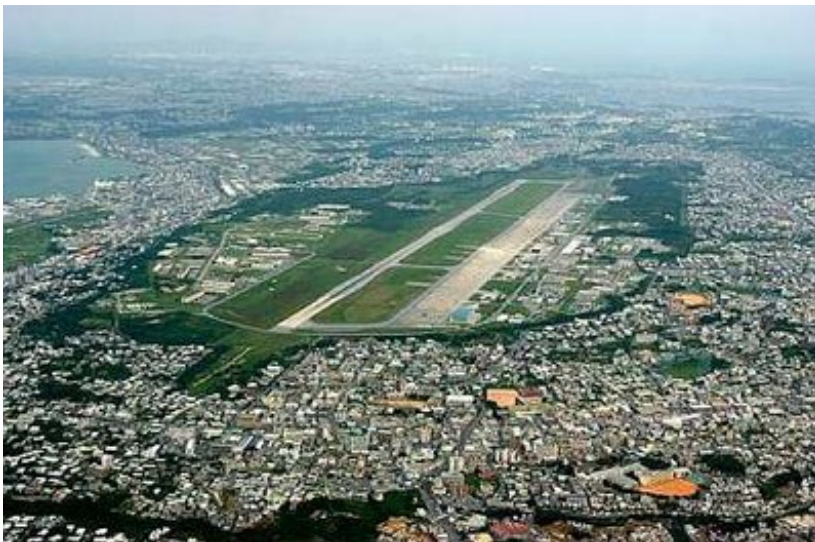
Futenma base in the middle of Ginowan City

The Okinawa experience brings into focus the humiliation of this extraterritoriality, but a recent incident here raises another question: When push comes to shove, to what extent is the US military willing to abide by even its own agreements?