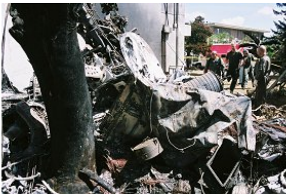
Marines inspect wreckage at the site of the crash

That evening a friend drove me through some backstreets, avoiding roadblocks, and we managed to get into the university, as far as the yellow tape blockade. Standing behind the tape was a line of Marine MPs, pistols on their belts. Behind them, Marines were dismantling the wrecked helicopter and loading it into trucks (from a police standpoint, destroying the evidence).