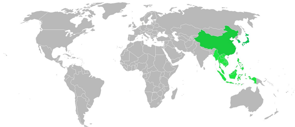
Map of ASEAN +3

ASEAN in 1997 invited China, South Korea and Japan to join a summit conference of ASEAN +3 out of which was born an East Asia Vision group. In 2001 it submitted a report called "We hope to create an East Asian Community (Kyodotai) for peace, prosperity and progress." ASEAN leaders supported that dream-like concept and in 2005 an East Asia Summit was held. However, Japan and China were in conflict about who should participate. The US, which was not invited, was dissatisfied, so the process has not been proceeding smoothly.