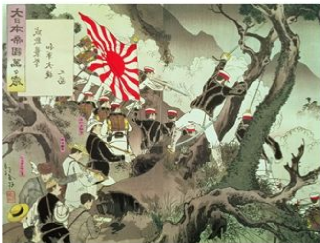
The First Sino-Japanese War fought in Korea in a contemporary Japanese woodblock print

The first fifty years of the eighty-year period was characterized by Japanese wars. The Sino-Japanese War of 1894-5, from the perspective of the issues contested and the battlefield can be called the first Korean War. Japan launched the Russo-Japanese War that followed in 1905 in order to force Russia to recognize Japanese rule of Korea. As a result of the war, Japan succeeded in making Korea a protectorate, then annexed it, and finally colonized it. In China, from the Manchurian Incident of 1931, Japan made war in China and elsewhere for fifteen years. Japan fought Russia in the Siberian War of 1918 with the dispatch of soldiers, again in the Nomunhon Incident of 1939, and then in the Russo-Japanese War in August 1945. With the US, Japan fought the 'Greater East Asia War.'