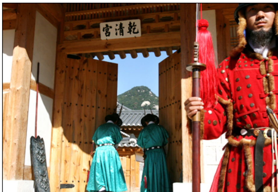
The Geoncheonggung Residence in the Gyeongbok Palace, the site of the murder of Empress Myeonseong, was reopened in 2007 for the first time in 98 years

Indeed, for half a century, Japan fought once or more than once with all neighboring countries to the West, North and East. Japan was always the attacker, and in the majority of cases, Japan was the aggressor. Those who were attacked and invaded were left with ineradicable scars and indelible pain. The murder of empress Myeonseong, the Port Arthur Incident and Tsushima Incident, and the Eulsa Treaty of 1905 making Korea a Japanese protectorate, Japan's repression of the March 1, 1919 Korean movement, the Marco Polo Bridge Incident in China in 1937, the Nanjing Massacre, and the Comfort Women, Pearl Harbor—these can never be forgotten.