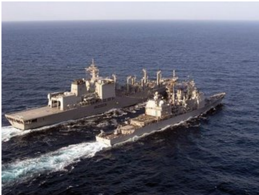
Japanese refueling mission in the Indian Ocean

Japanese Maritime Self-Defense Forces, meantime, while engaged in refueling activities for CTF-150 vessels in the Indian Ocean, operate within the effective bounds of Japan's domestic policing laws, possessing as yet neither the constitutional leeway to engage in forcible maritime interdiction on the high seas with arms drawn nor the authority to escort vessels other than Japan-registered ones.