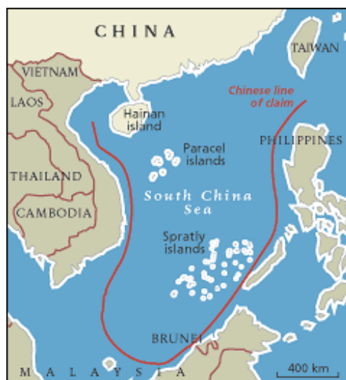
Chinese claims in Spratly Islands area

In the Spratlys, the armed garrisons that all the claimants (except Brunei) have stationed on the tiny dots of land they say are theirs are still in place and, in some cases, have been reinforced. A code of conduct for the South China Sea, signed by Beijing and ASEAN (the Association of South East Asian Nations) in 2002, is voluntary. A joint seismic survey of hydrocarbon resources, agreed in 2005 by the national oil companies of China, Vietnam, and the Philippines, lapsed last July and may not be renewed. Even when it was operational, the tripartite seismic survey did not include the other three Spratly Island claimants. Moreover, it covered only a small part of the contested sea area.