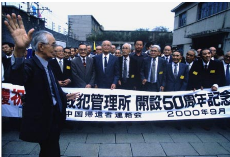
Chukiren celebrates its fiftieth anniversary in September 2000

Unfortunately, as we entered the year 2000, our average age surpassed 80, and many of those who worked tirelessly began to pass away.