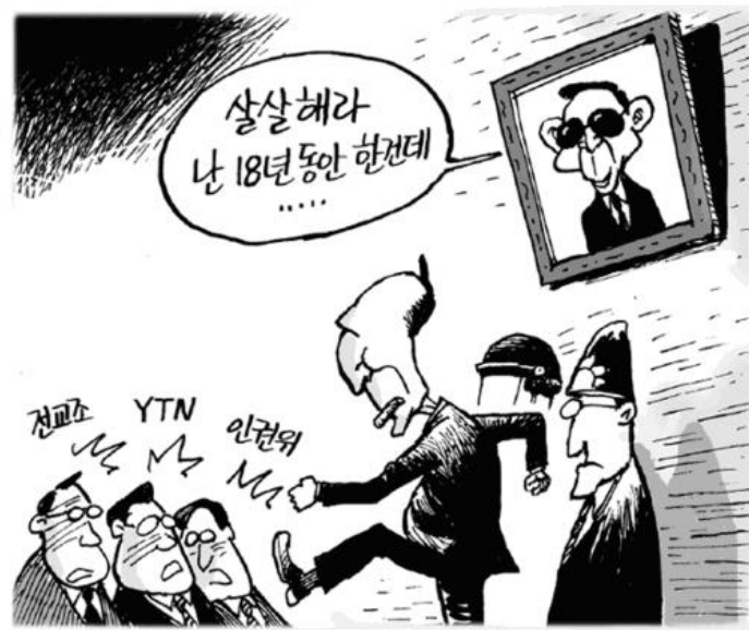
Former President Park Chung-hee tells President Lee Myung-bak, busily kicking at the Korean Teachers and Education Workers Union (KTU), the cable broadcaster YTN and the National Human Rights Commission of Korea, to “be gentle and take your time” in gaining control over organizations like these that are quickly losing their independence because Park took his time... eighteen years to be exact. (Hankyoreh Geurimpan, 13 December 2008)