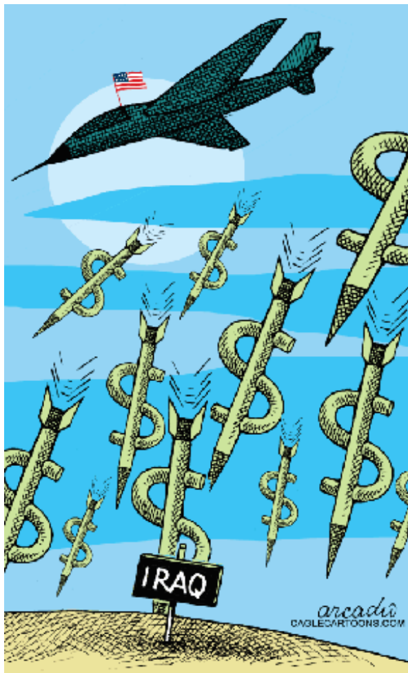
The $3 trillion war in Iraq

In the long run, this was not a sustainable source of wealth for America's financial class, which is now suffering like everyone else from the consequent recession. But in the short run, the financial crisis and bailout made it possible for Bush to wage a costly war without experiencing the kind of debilitating inflation that was brought on by America's Vietnam War.