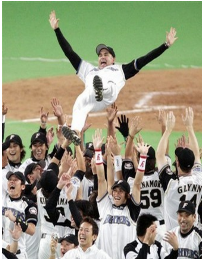
ICCND October, 2008 meeting

The issue of nuclear war and nuclear disarmament have repeatedly been submerged in recent years by issues of terrorist attack and wars such as those in the Congo, Rwanda, Afghanistan, Iraq and Gaza. But as former Foreign Minister Gareth Evans recently pointed out at the October meeting of the Australia-Japan International Conference on Non-Proliferation and Disarmament, "The truth of the matter is that there are at the moment, depending on how you calculate these things, somewhere between 13,000 and 16,000 nuclear warheads actively deployed, a great many of them still on hair-trigger alert even though the Cold War has been long over. And between them having a phenomenal destructive capability. The reality also is that we are on the brink - after years and years of containing rather well the emergence of new nuclear weapon states, with all the risks of either deliberate or accidental use of nuclear weapons that flows from the existence of nuclear weapons or nuclear arms proliferation . . ."