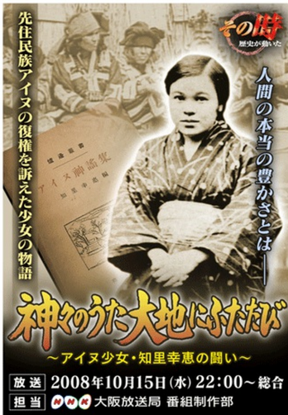
NHK poster for the Chiri Yukie installment of the “Sono toki rekishi wa ugoita.”