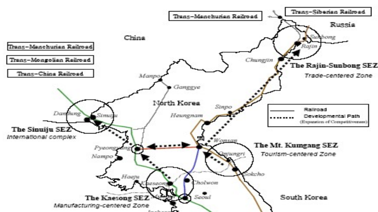
Figure 1. The Developmental Path of the North Korean SEZs

As a consequence, the proportion of the economically active population (15-64 year olds),