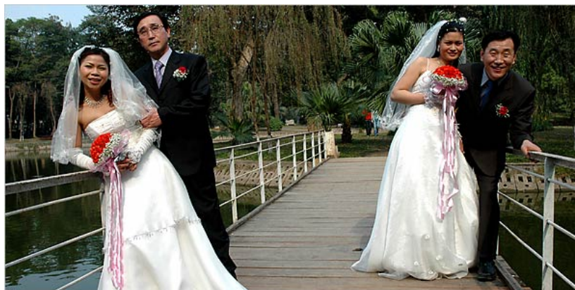
Korean men marry Vietnamese women in Vietnam

The proportion of intermarriages in total marriages in Korea has jumped more than ten-fold since 1990, accounting for nearly 14 per cent in 2005. This coincided with the growing number of migrant workers in Korea (see Table 2). The soaring number of international marriages is also due to a significant growth in the number of “picture brides” from abroad.