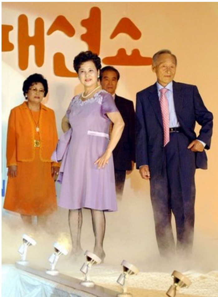
Korea's aging population

Korea is one of the world's most rapidly aging societies and its fertility rate is falling at a record pace to a level well below the replacement rate of 2.1 children per family. In 2000, Korea became an "aging society," in which 7 per cent of the population consists of the elderly (those 65 years or older). If current population trends continue, the country will transition to an "aged society" in 2019, when 14 percent of the population will be elderly. Korea will become a "superaged society" by 2026, when the elderly would make up 20 per cent of the population.