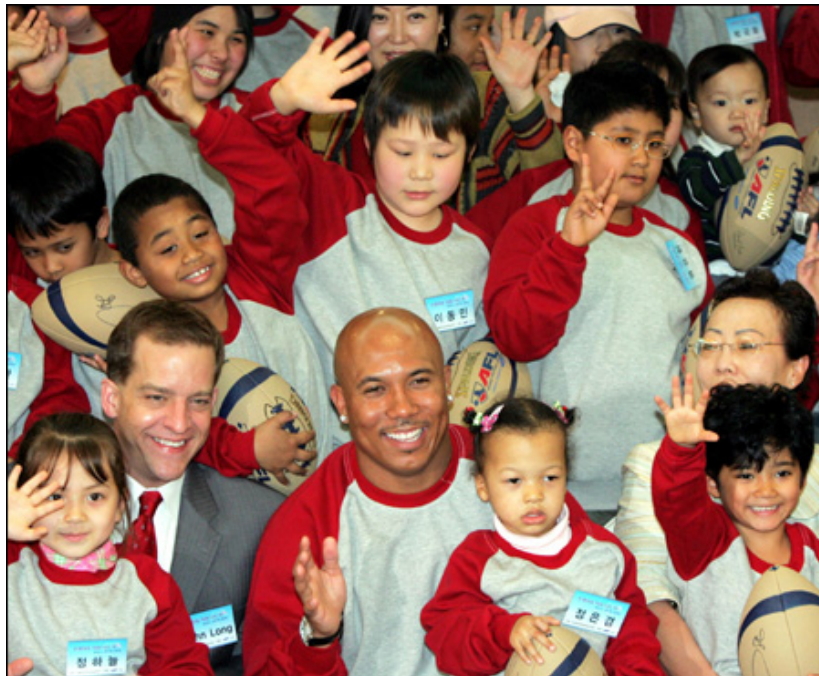
Bi-ethnic and bi-racial children in Seoul