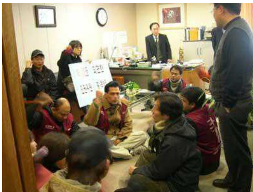
Migrant workers in Korea organize

Since the late 1980s, Korea changed from a labor-exporting nation to a labor-importing nation (Park 1994). When foreign migrant workers began arriving in Korea in 1987, the shortage of manual workers was estimated at 100,000, mainly in small- and medium-sized manufacturing firms (Kwon 2004, p. 1). Since the mid-1980s, Korea has experienced a deceleration in the growth of the domestic labor force as the rural labor surplus was exhausted and the participation rate of youth (15-19 age group) in the labor force declined significantly due to longer schooling. The labor shortage was also caused by the booming construction industry, which drew Korean workers out of relatively low-paying factory jobs into higher-paying construction work. Moreover, growing labor market segmentation since the early 1990s brought about uneven labor shortages: large firms subcontracted some of their labor-intensive production lines to small firms (5-29 employees) to cope with growing national and international competition, leading to an increase in the percentage of employees in small firms from 18.3 per cent in 1980 to 27.6 per cent in 1995. The labor shortages in Korea were and are thus “more serious in smaller firms than in larger firms, and in unskilled jobs than in highly skilled jobs” (Lee, H. 1997, p. 357). The labor shortage in manufacturing became very serious in 1991 when unfilled production jobs totaled 222,000.