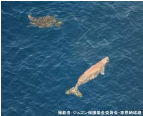
Dugong and sea turtle in Oura Bay