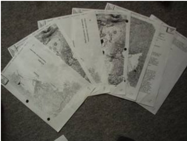
DoD court documents