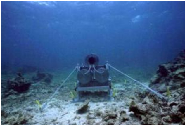
Video-camera set up in the dugong’s pathway

In May 2007, the Japanese government began “preliminary surveys” to collect “basic data” on the environment of the Henoko and Oura areas before officially beginning its EIA process. Anti-construction activists and environmentalists denounced the surveys, arguing that incorporating the results of the preliminary surveys into the yet-to-be-began EIA process was against the EIA law.[23] They also criticized some of the methods used in the surveys as scientifically unproven and harmful to the dugongs and the environment.[24] Some anti-construction activists launched sit-ins on the ground and waters of Henoko and Oura Bays.