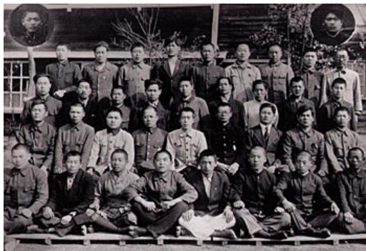
Korean forced labourers of Aso Mining Co. in front of their dorm at the Atago Mines

At the three-party (Japan, China, South Korea) summit held in Fukuoka, Japan in December 2008, Japan's Aso Taro and Korea's Lee Myung-bak adopted a similar stance, agreeing to bury historical problems in order to concentrate on the economy. When we recall that the company run by Aso's family during World War II had used Korean forced labour at its mines and that Aso had previously infuriated Koreans by defending wartime atrocities, Lee's setting aside of history can be interpreted as a sort of priority to economic benefit over justice and national dignity.