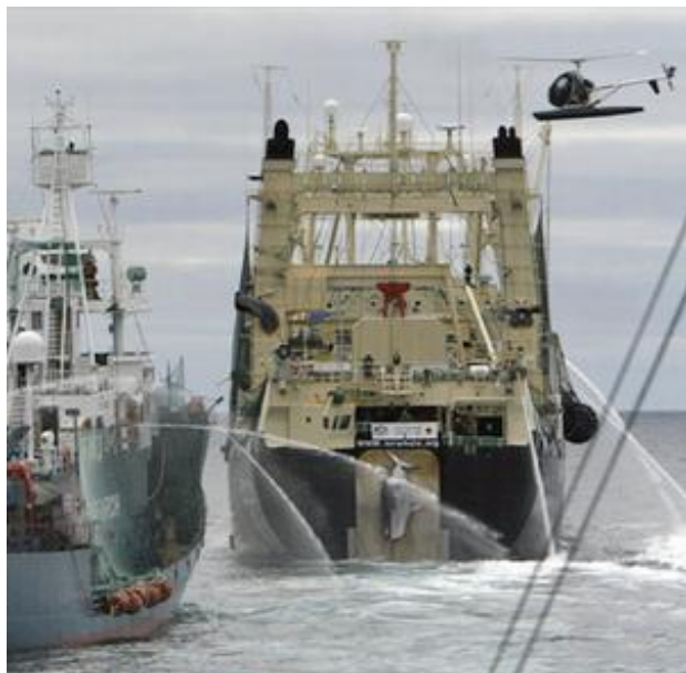
On February 6, 2009 a Japanese factory ship the Nishin Maru pulled in a Minke whale.

Under the terms of the research, the Japanese government orders the catching (and killing) of a large number of whales. This is to determine the population size, to generate more accurate statistics, and to collect earwax, which is used to determine the age of whales. But Japan's fleet mainly catches minke whales, which are common, and if the research can be done without killing whales the fleet will do so.