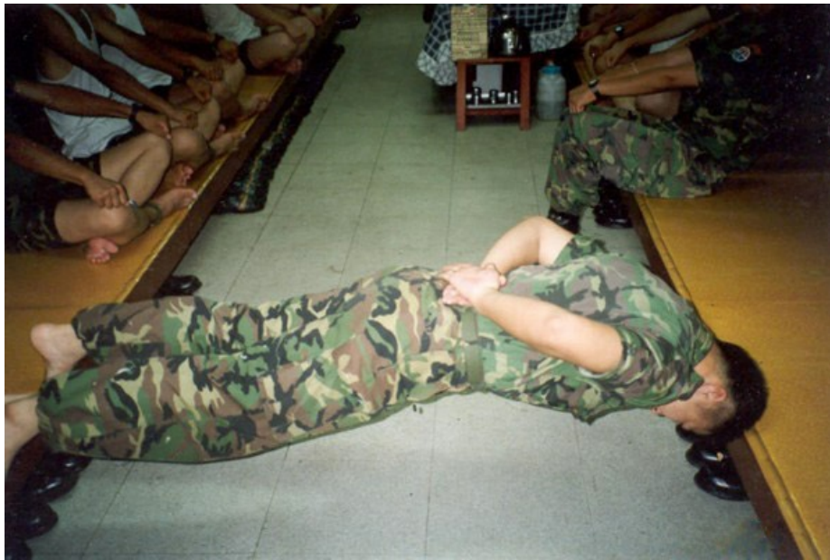
Everyday brutality – a conscript being punished by a senior soldier in the Korean Army