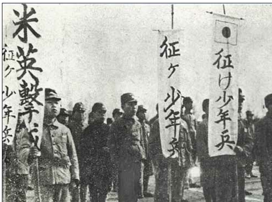
Korean youths conscripted by the Japanese authorities in the last years of the Pacific War

Conscription, first applied to Korean subjects of the Japanese Empire by Japanese colonial authorities in 1943 (promulgated March 1, effective August 1), was reintroduced soon after the establishment of the post-colonial Korean state on August 15, 1948. The first Military Duty Law (pyōngyōkpōp), promulgated on August 6, 1949, drew largely on colonial precedents and continental European (German and French) models, putting all male citizens under the age of 40 under service obligations, requiring those whose obligations were unfulfilled to return from sojourns abroad before reaching the age of 26 (and prohibiting