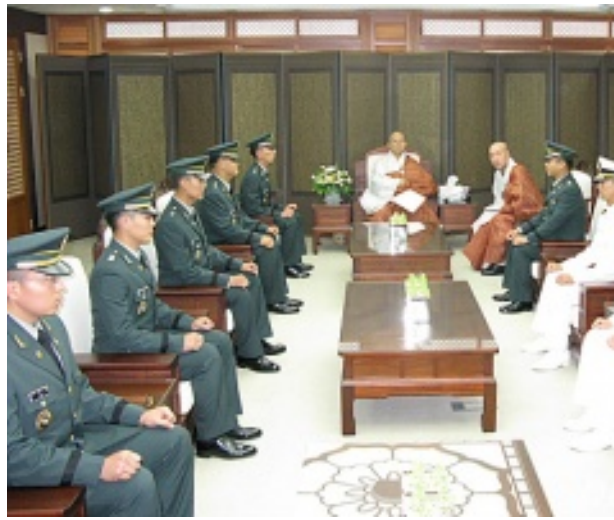
Buddhist chaplains (kunsŭng) in the Korean Army, wearing military uniforms, symbolize the collusive ties between institutional Buddhism and the military

O T'aeyang's pioneering declaration and the momentous controversy it created, were followed by successive "coming-outs" of other COs. The non-Jehovah witnesses who declared their refusal to undergo military training in the 2000s – numbering around 30 in 2001-2007 – may be categorized in the following way: