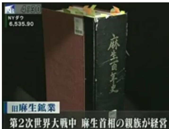
Published by Aso Taro in 1975, The 100-Year History of Aso does not mention the company's POW workforce

"We had several falls at the coal mine. Some of them were quite big, but fortunately no one was seriously injured. The camp itself consisted of new buildings. But the situation in the mine was terrible. It took us half an hour to walk down for around one mile from the entrance to the coal face. We worked in two shifts for twelve hours a day. I was around 80 kilograms but towards the end of the war my weight was down to around 48 kilograms. I'm ready to receive any kind of compensation from the Japanese government."