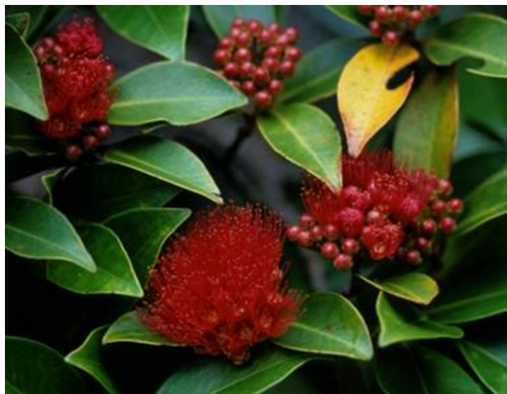
Muni futomomo ( Metrosideros boninensis ), (Yasui Takaya)

'Nature' is commonly defined as 'phenomena of the physical world as a whole' and 'culture' as 'refined understanding of the arts and other human intellectual achievements; customs and civilization of a particular time or people; improvement by care and training; cultivation of plants, rearing of bees silkworms, etc' [1]. This paper adopts instead the concept of 'environmental culture' ( kankyō bunka ) as its core. It has been used in Japan for more than a decade to title books, articles and public talks, and to name university departments. Environmental culture' can be defined as 'the ideas, beliefs and customs that are shaped by a society's understanding of its natural environment, and are used to protect the environment'. This paper focuses on the correlation of nature and culture on the Ogasawara Islands in terms of their continuing evolution.