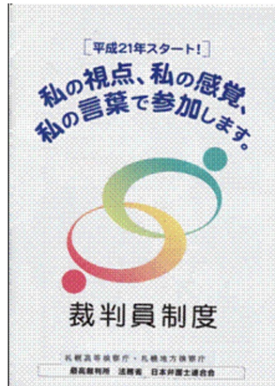
"The Lay Assessor System: Participating with My Opinions, My Sentiments, and My Words" -- cover of undated Supreme Court pamphlet for public distribution, 2006.

On May 21, 2009, lay citizens will join professional judges in deciding the fate of suspects of major crimes in Japan's new saiban-in or lay assessor system. [1] This system, laudable for pursuing public understanding and reform in a judiciary long criticized for being distant and overly bureaucratized, contains provisions that could do as much harm as good. Among causes for concern, the new law contains a harsh secrecy provision that stands out as a potential source of problems. This provision, which threatens to imprison or fine citizens who speak too freely about their service as lay assessors, will make reporting misconduct difficult and chill the public discourse that the system ostensibly aims to foster. Such secrecy may also inflict significant psychological harm upon those affected by the disturbing details of a criminal trial. These potential ramifications should be taken into consideration as Japan makes its way through this new world of lay participation.