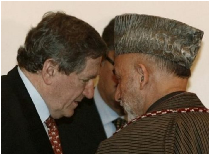
Holbrooke and Afghan leader Karzai

Holbrooke excoriated America's existing drug-eradication strategies, particular aerial spraying of poppy fields: "The ... program, which costs around $1 billion a year, may be the single most ineffective policy in the history of American foreign policy....It's not just a waste of money. It actually strengthens the Taliban and al Qaeda, as well as criminal elements within Afghanistan."