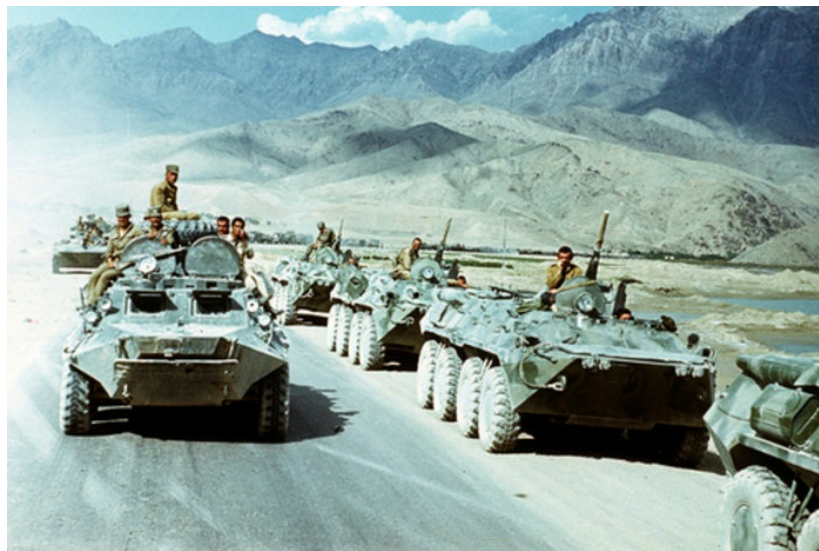
Russian forces in Afghanistan

Meanwhile, especially after 1980, moderate Sufi leaders in the countryside were progressively displaced in favor of radical jihadist Islamist leaders, thanks to massive funding from agents of the Pakistani ISI, dispersing funds that came in fact from Saudi Arabia and the United States. Already in the 1970s, as oil profits skyrocketed, representatives of the Muslim Brotherhood and the Muslim World League, with Iranian and CIA support, “arrived on the Afghan scene with bulging bankrolls.” 5 Thus the inevitable civil war that ensued in 1978, and led to the Soviet invasion of 1980, can be attributed chiefly to Cold War forces outside Afghanistan itself.