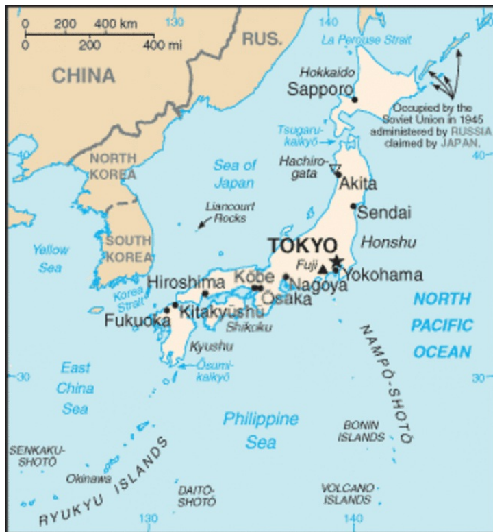
Map showing contested areas including Senkakus and Takeshima (Liancourt Rocks)

The Sea of Japan is also known as the East Sea