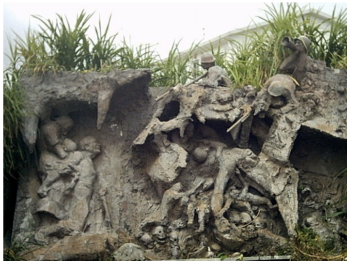
Okinawan sculptor Kinjo Minoru's relief depicting the Battle of Okinawa, during which many Okinawans were killed or forced to commit suicide after seeking refuge in the island's caves.

The censorship of history texts attracted little attention at this time from the Japanese media, in part due to preoccupation with textbooks for a new high school subject "Contemporary Society" ( Gendai Shakai ). The MOE rigorously censored their descriptions of the 1946 Constitution, the Self-Defense Forces ( Jieitai , SDF), the Northern Territories conflict with the USSR, and discussions of human rights and industrial pollution. For example, textbook examiners commented: "Give an objective description without bias. Do not lean toward the theory of unconstitutionality [of maintaining SDF]. Provide balance by including the government's view and other views" (on Article 9 and renunciation of war); "Pay attention to the size [of pictures] and better keep too tragic pictures small" (referring to pictures of Hiroshima and Nagasaki). 31